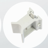
Pole mounting bracket