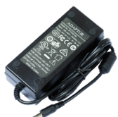
24V 2.5 A power adapter